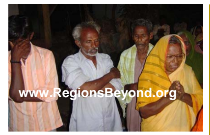
Night evangelism in Hindu villages

Advanced Leadership Training: Two hundred and eighteen pastors registered for the conference but the number grew each day as news of the teaching filtered into surrounding areas. This was the most productive conference we have yet held in India as the training and maturity level of the pastors has consistently increased. The most telling realities are that their churches are growing in membership, the commitment level of Christians continues to increase and new, young leaders are rising up.