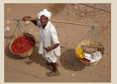
Chili pepper vendor stops by