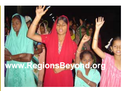
Salvation comes to Hindu village

indus respond to gospel: Regardless of the culture or religion, the gospel message is the power of God unto salvation. When the gospel is clearly preached, people will repent and give their lives to Jesus. In every meeting held in India, the response was overwhelming.